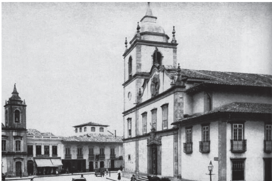
Cathedral square in a photo of 1880 by Marc Ferrez. The old Cathedral of Sao Paulo (1745-1912), baroque style, 1616.

Until 1745, São Paulo Diocese belonged to Rio de Janeiro and, by pope Benedictus P.P XIV bull Candor Lucis Aeternae (Candor of the Eternal Light), it was elevated to the seat of the Diocese. Even though